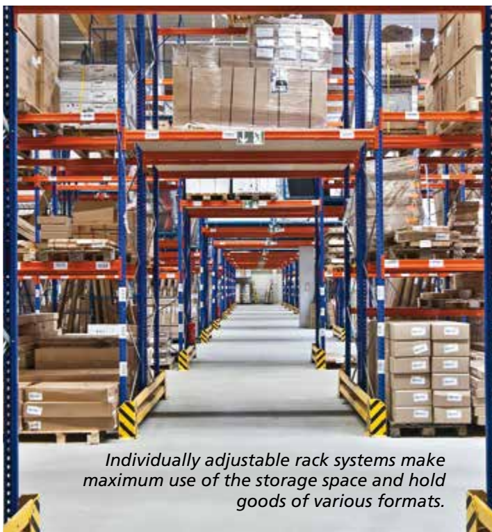
Individually adjustable rack systems make maximum use of the storage space and hold goods of various formats.